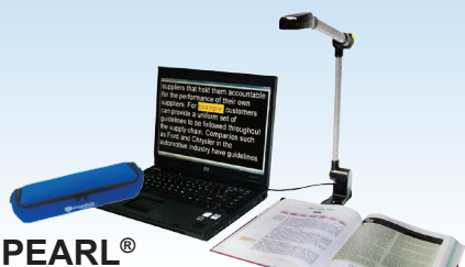
PEARL ® Portable Reading System for instant audible access to printed materials

Visit us online at www.FreedomScientific.com to learn more about these and other innovative products from Freedom Scientific that make living with low vision easier.