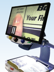
TOPAZ XL HD ® Desktop Video Magnifier with true HD and the widest available viewing area